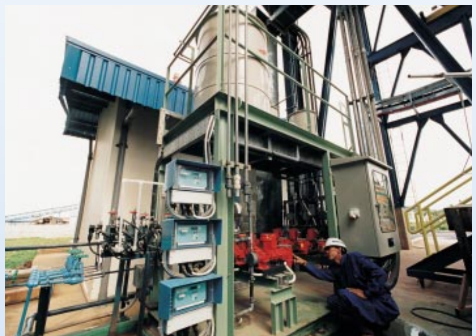
AUTOMATIC CHEMICAL DOSING SYSTEM FOR COOLING WATER

The filter press package is of the plate and frame type which compacts the sludge to 20% solids consistency. Liquid extracted from the