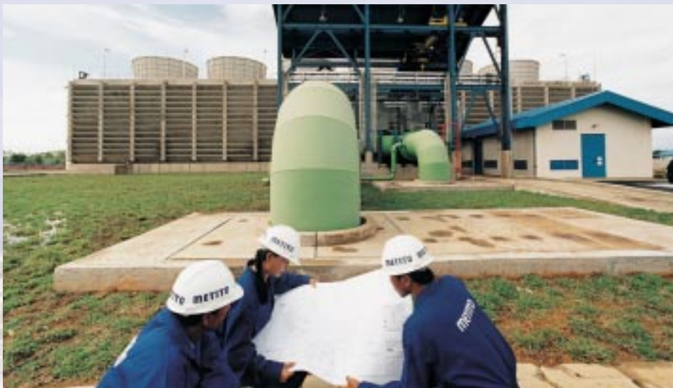
POWER PLANT COOLING TOWERS

sludge is fed into the ACRO buffer tank for reprocessing. The remaining sludge after compression is taken into the filter cake hopper and unloaded into trucks for disposal.