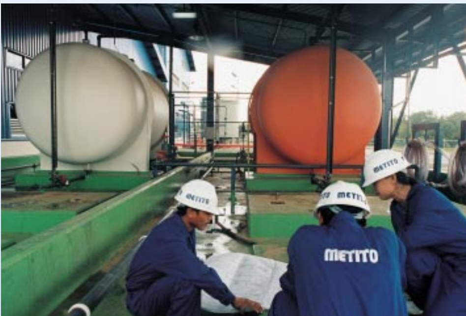
CHEMICAL STORAGE TANKS FOR THE DEMIN PLANT