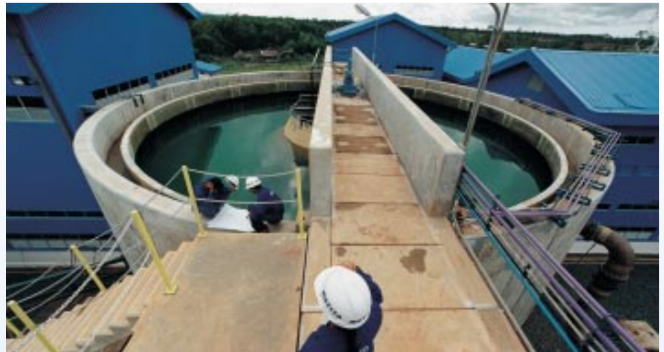
A CLARIFLOCCULATOR IN OPERATION

chloride for coagulation. After a predetermined period for the reaction to be accomplished, treated waste is discharged for disposal.