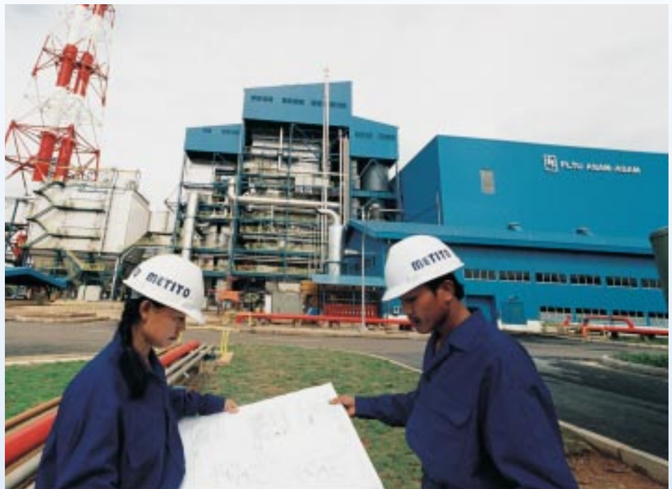
OVERVIEW OF THE POWER PLANT