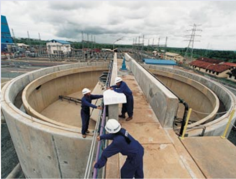
A VIEW OF ONE OF THE OLARIFLOCCULATORS

incoming water have been managed in the overall process design by the use of automated bypasses and re-circulation arrangements.