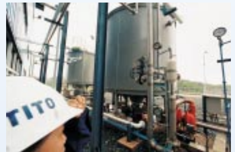
PROCESS WASTE BUFFER TANK & PUMP

Sludge collected at the bottom of the clarifier tanks is periodically drained down into the sludge treatment plant, where it is thickened in a sludge thickener. The thickened sludge is